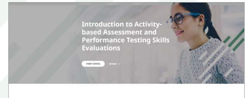
Figure 1 - This introductory course provides an overview of performance testing and Activity-based Assessments.

This example course demonstrates various methods for presenting knowledge in engaging and effective ways.